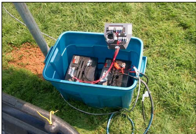
Fig. 6. Protect the batteries and charge controller from the elements.

Some deep cycle marine batteries need to be filled periodically with distilled water. Also be sure to keep the panel free of debris so that it is not shaded and can charge the pump at a maximum rate.