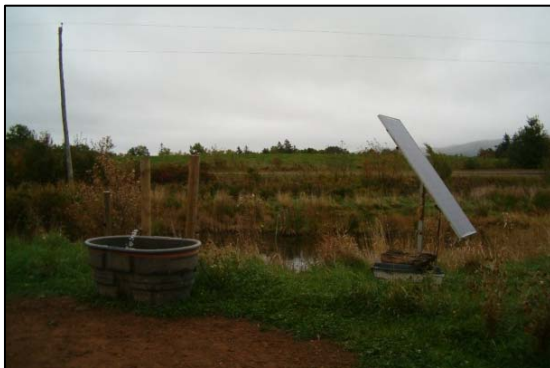
Fig. 2. A solar powered pumping system pumps water from a pond to a 570 L trough with a 100 watt panel.

Solar powered pumping systems (Fig. 2) convert the sun’s energy into DC power which runs a 12-volt, high volume water pump. The solar panel converts the sun’s energy to either run the pump directly (called a direct system) or stores the energy in deep cycle marine batteries which in turn run the pump (an indirect system).