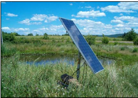
Fig. 1. An alternative watering system and riparian fencing will protect the surface water source.

In Nova Scotia, many producers are adopting alternative watering systems to limit livestock access to streams and ponds. Solar powered pumping systems can be used to supply water from a pond or watercourse. For information on other methods, see the factsheet titled “Alternative Livestock Watering Systems for Pastures.”