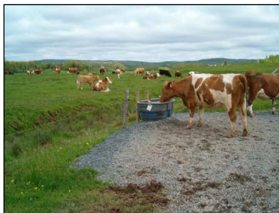
Fig 7. Providing a solid surface further reduces damage to soil in riparian areas.

Many companies can supply whole systems with a minimum of information from the purchaser and shipping is usually low. Search online for dealer listings across the country. Alternatively, individual components can be purchased from local department stores or distributing centers online.