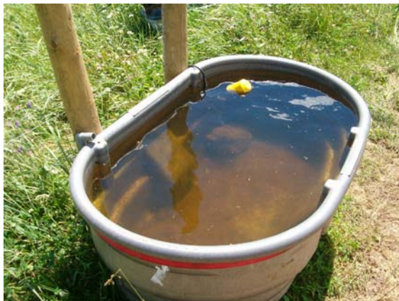
Fig. 5. Trough size depends on herd size and travelling distance. A 570 L (125 gal) trough can supply water to 40-50 cow-calf pairs.

*Finishing cattle may require more water