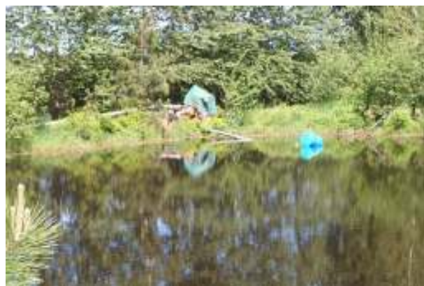
Figure 1: A typical surface water source, showing a withdrawal point for an irrigation system.

The challenge is that surface water is generally susceptible to microbial contamination, as it is inherently exposed to common sources of contamination. In addition, irrigation demand is often greatest when conditions of increased contamination risk exist. Irrigating crops with water exceeding CCME guidelines increases the risk of food borne illness. Therefore proper source water management is necessary. This factsheet will discuss E. coli management considerations related to irrigation and present several treatment options that farmers can consider to improve the microbial quality of water used for irrigation.