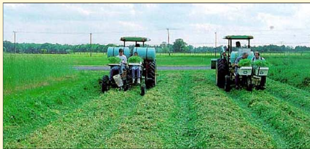
Figure 3. Transplanting tomatoes into mechanically killed hairy vetch. (From USDA Farmer's Bulletin No. 2279).

Planting cover crops known to readily winter-kill is another non-chemical means of vegetation management. Spring oats, buckwheat, and sorghum fill this need. They are fall-planted early enough to accumulate some top growth before freezing temperatures kill them. In some locations, oats will not be completely killed and some plants will regrow in the spring. Winter-killed cover crops provide a dead mulch through the winter months instead of green cover. They are used primarily in regions where precipitation is limited, such as West Texas, and in situations