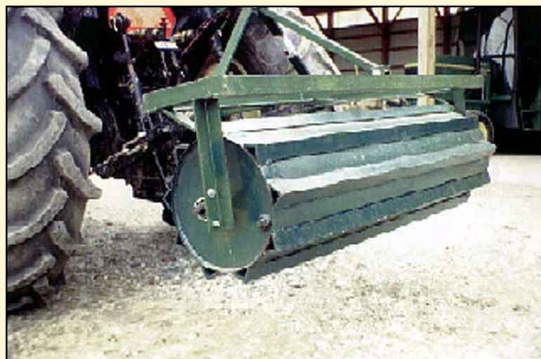
Figure 2. A homemade roller to kill cover crops (From USDA Farmer's Bulletin No. 2279).

Water consumption by green manure crops is a concern and is pronounced in areas with less than 30 inches of precipitation per year. Still, even in the fallow regions of the Great Plains and Pacific North-