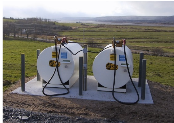
Fig.1. Fuel tanks on a concrete pad with protective posts.

All fuel tanks should be ULC or CSA approved. Tanks should be placed on a reinforced concrete pad with posts or guardrails to protect them from vehicles. The concrete pad should extend 30 cm beyond the edge of the tanks to collect any drippings and enable visibility to all parts of the tanks (Fig. 1).